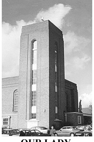
OUR LADY, OUEEN OF APOSTLES